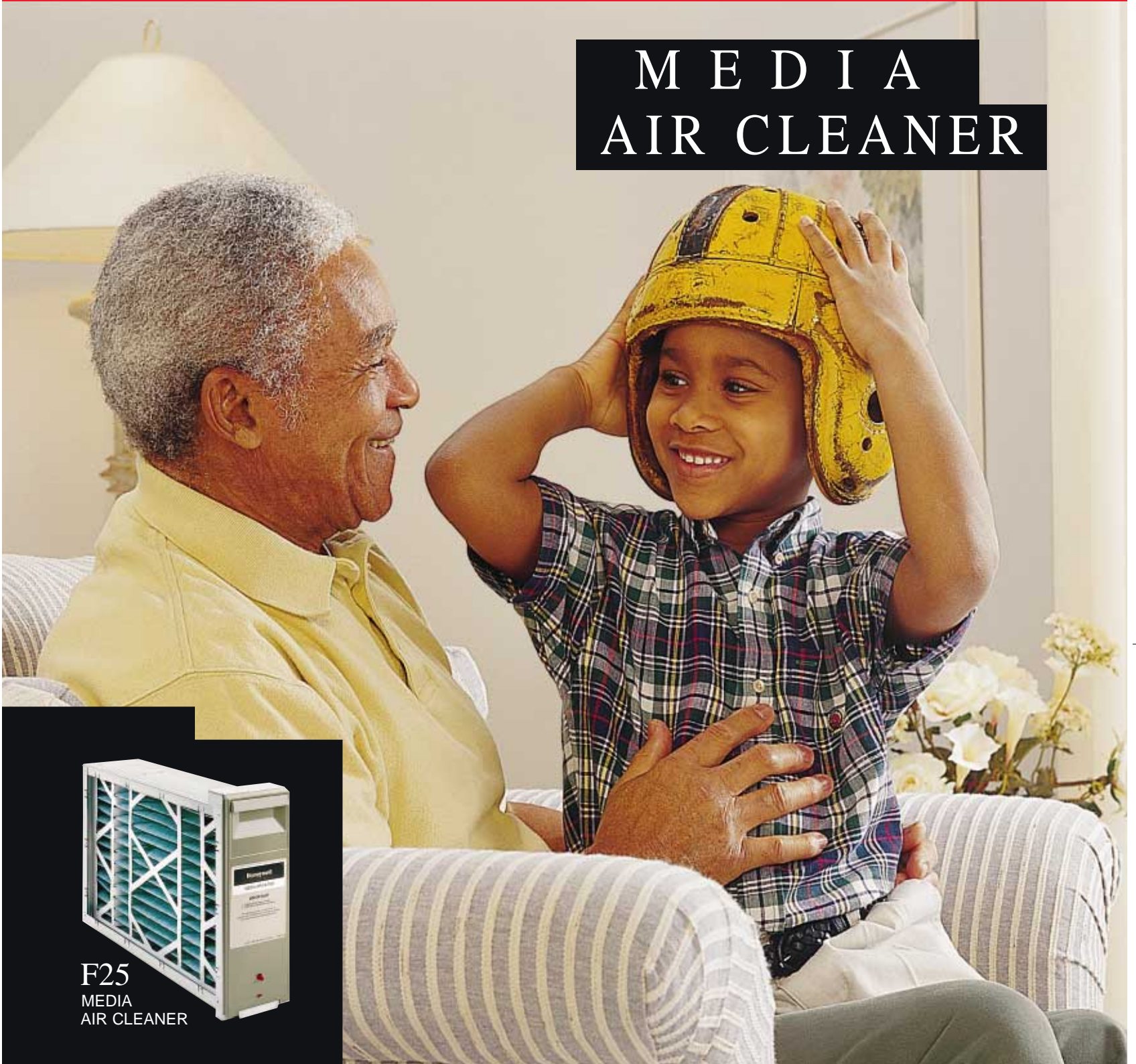
F25 MEDIA AIR CLEANER

Adding to or upgrading your heating and cooling system? While you're making big decisions about equipment, don't forget about improving your indoor air quality.